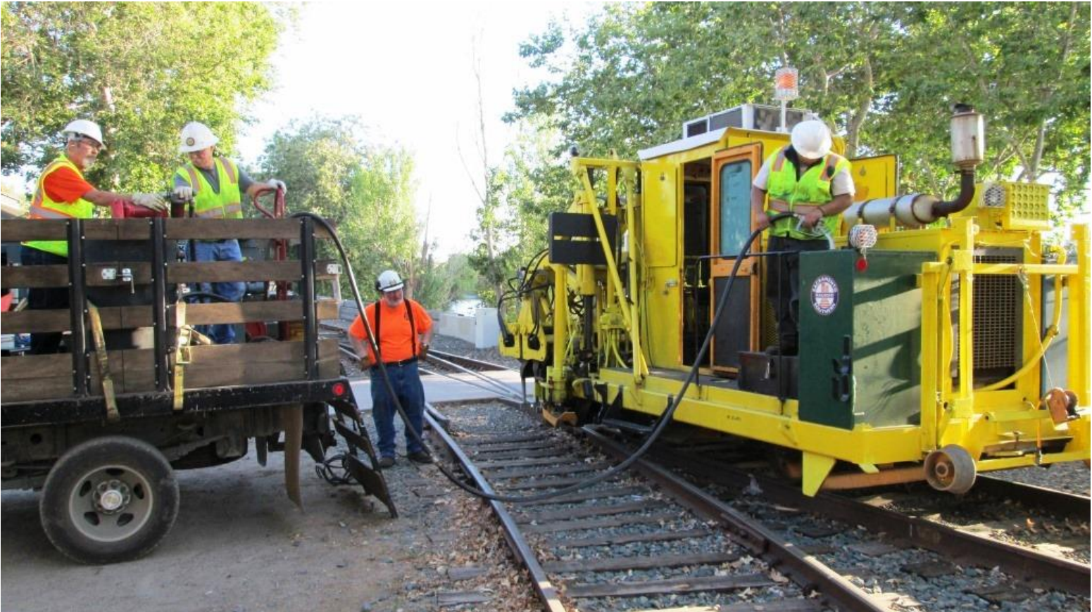
Fill 'er up! Anthony fuels the tamper