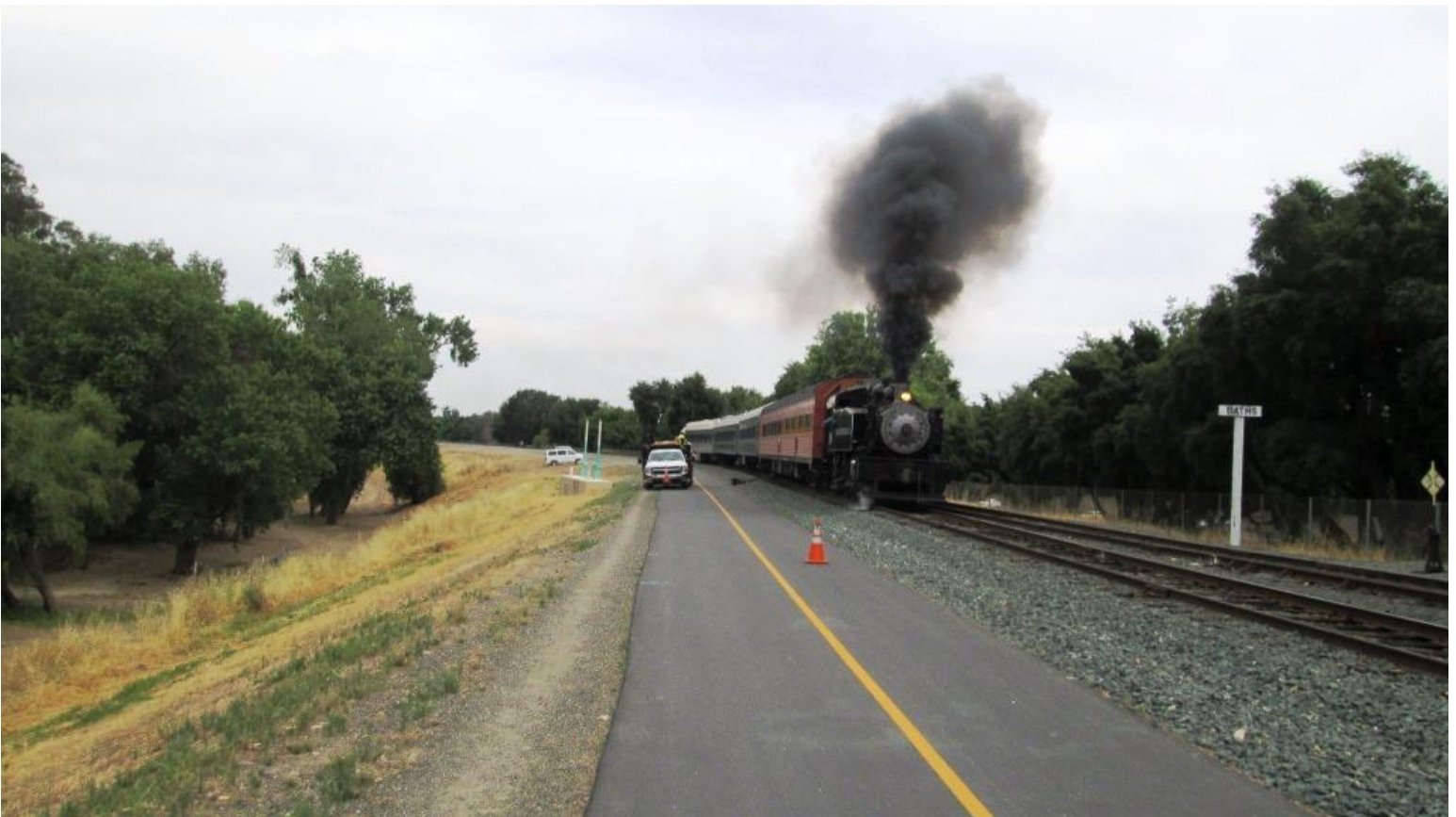
It's train time!