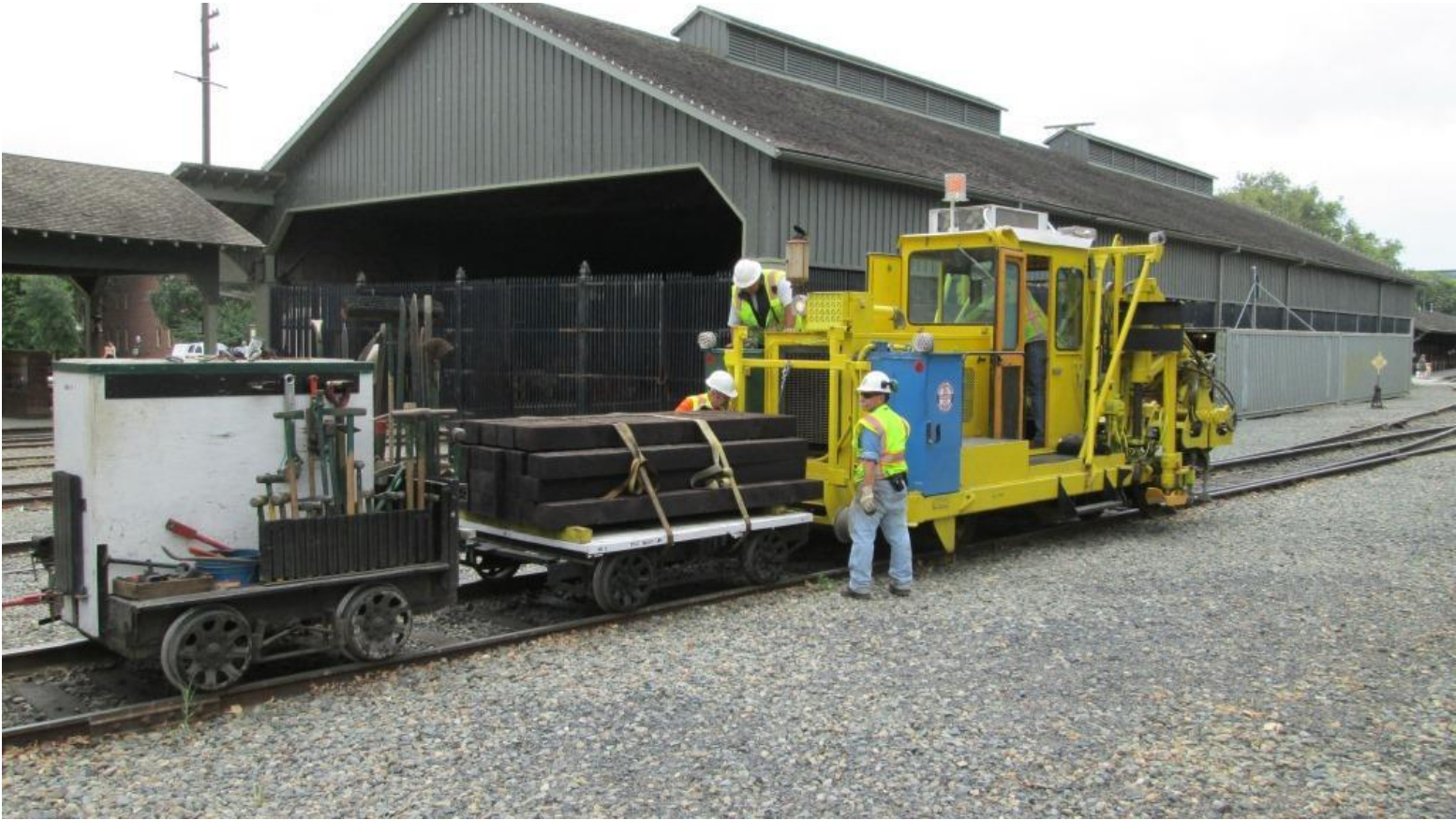
Back in town, the Team gets the equipment put away