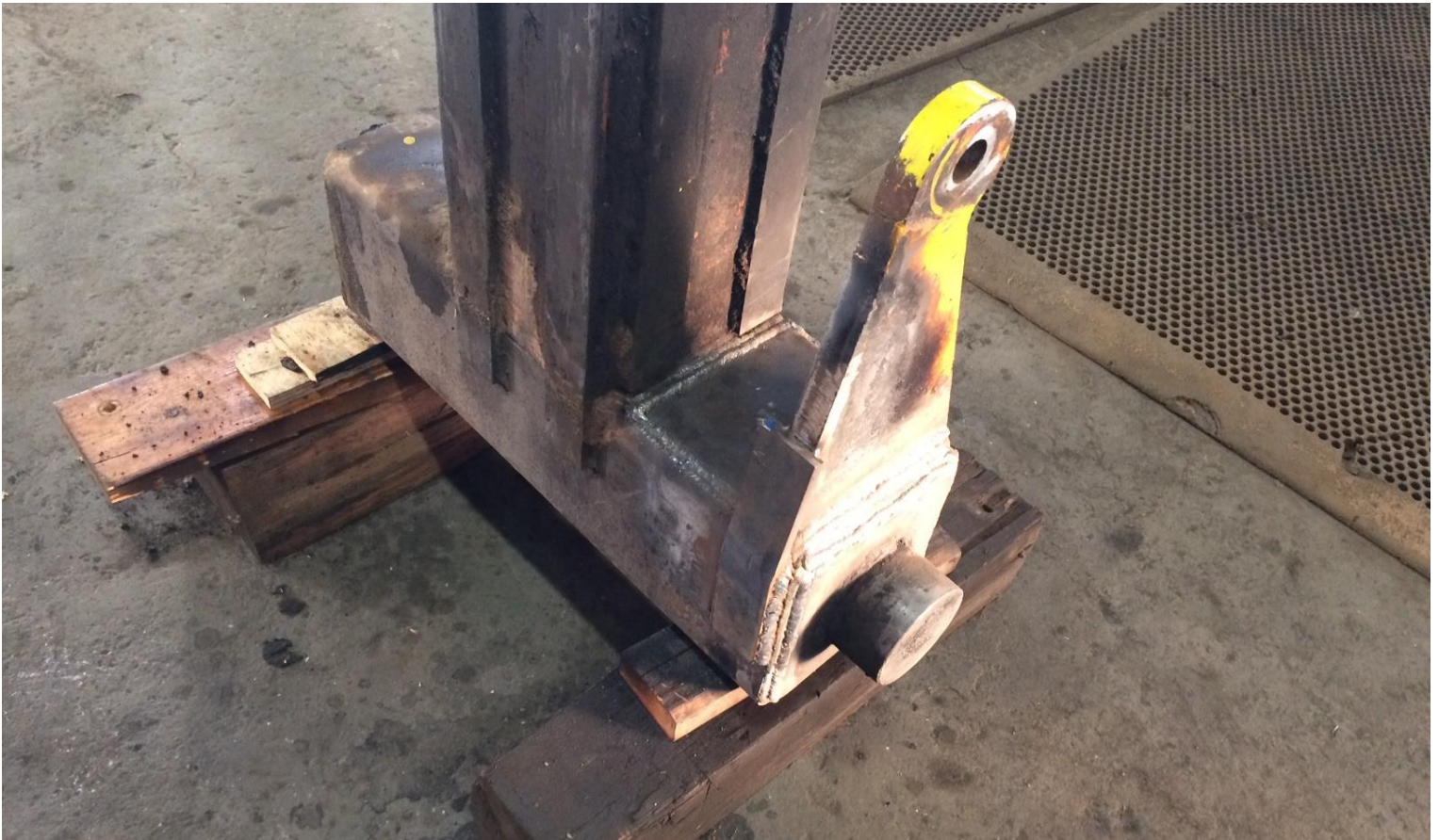
The modified pivot-arm complete with the new steel-strut, fabricated by Cliff, between the base of the arm and the lift point