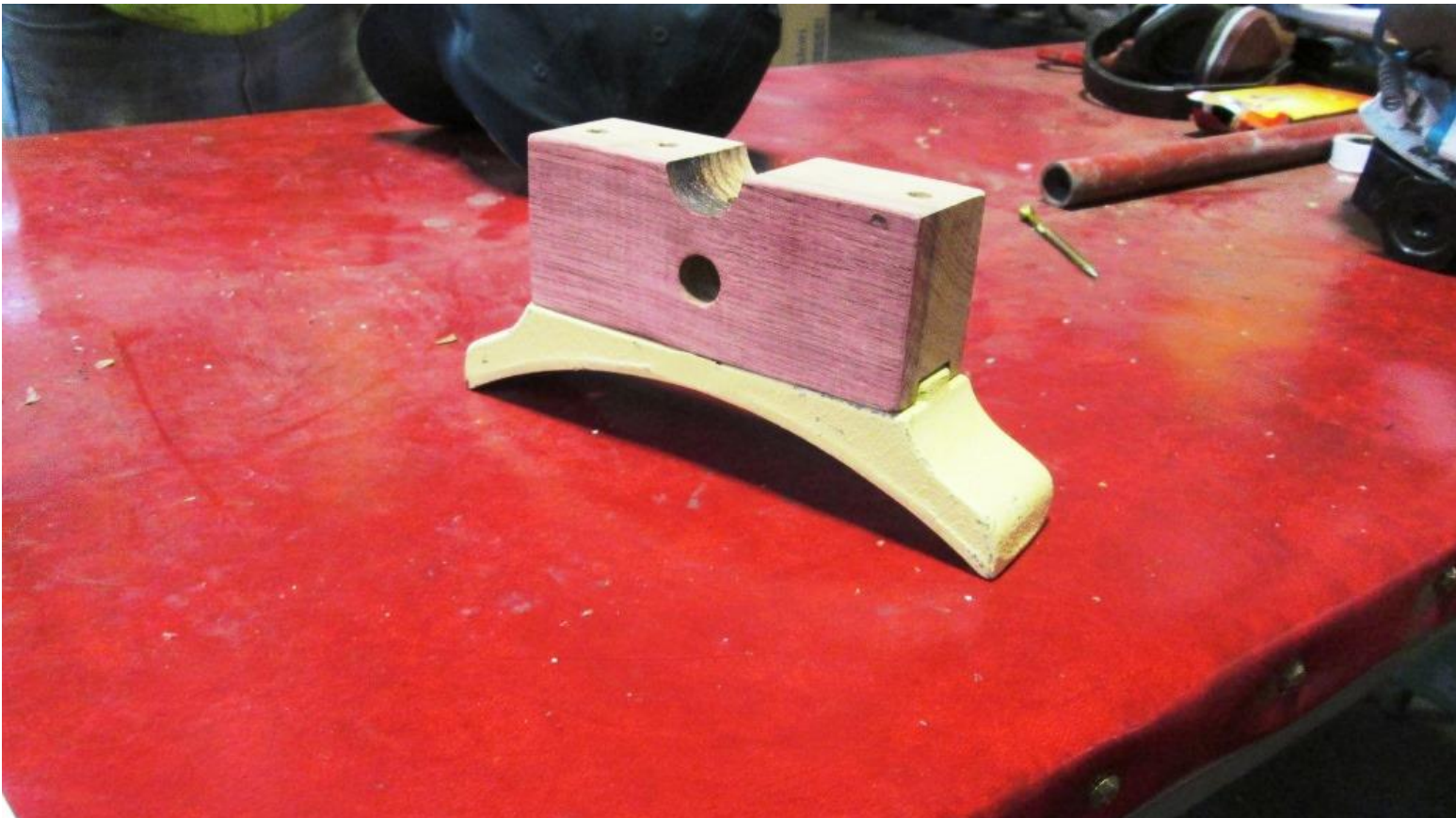
Master carpenter Dusty made these new brake-shoe separator from oak wine barrels